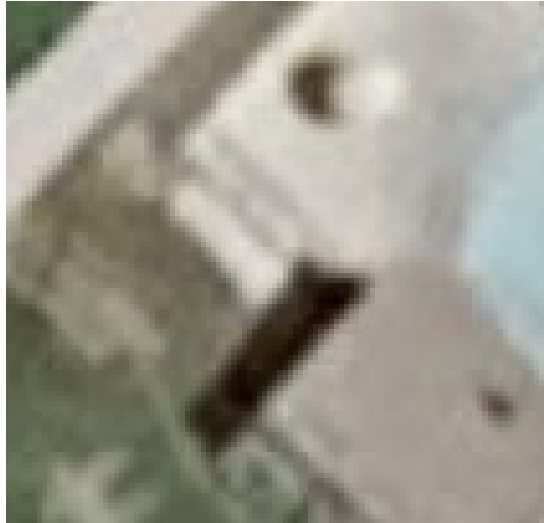
Pool Area Ramp to New Access Point - $3,400