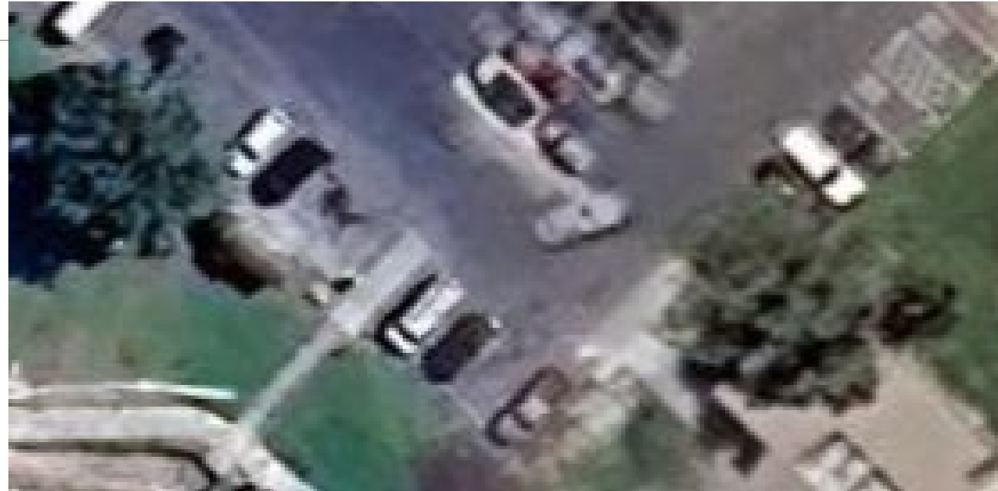
Signage Area by Lake - $3,200