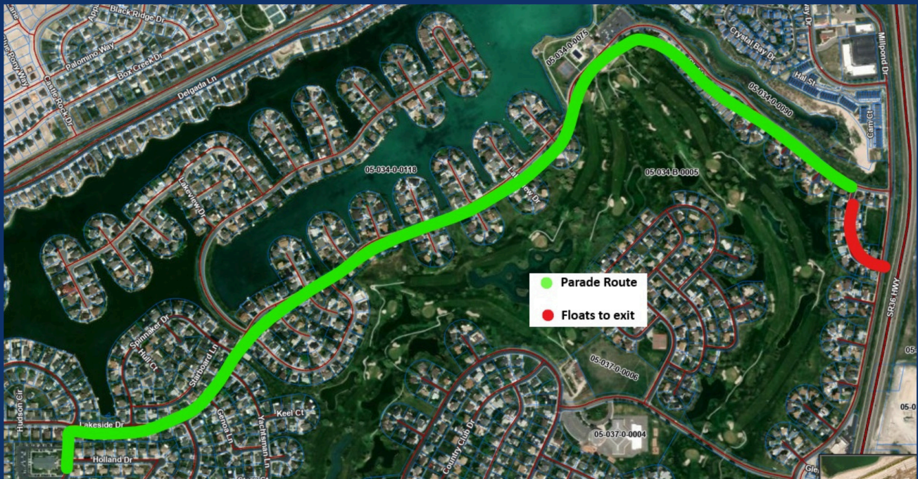
Stansbury Days 2025 Parade Route